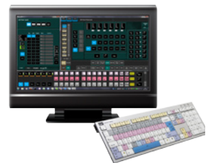
KRR-LIC-1ME-GUI provides a software and keyboard option for controlling Karrera.